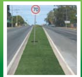
Councils and Public Areas

Call us for a free measure and quote 0410 445 524 or visit us at www.enduroturf.com.au